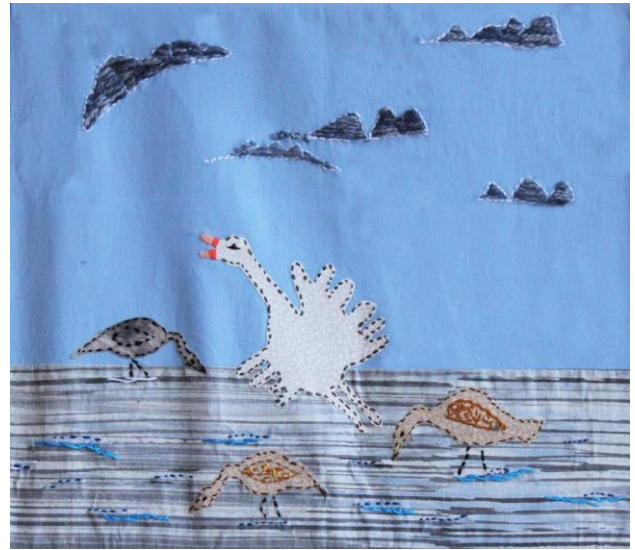
Taking Flight by David H.

do it" until sewing staff told me to just try it and now I'm loving it. I feel accomplished and proud to be able to do weaving.