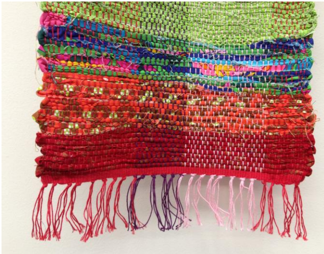
Weaving by Lisie Y.